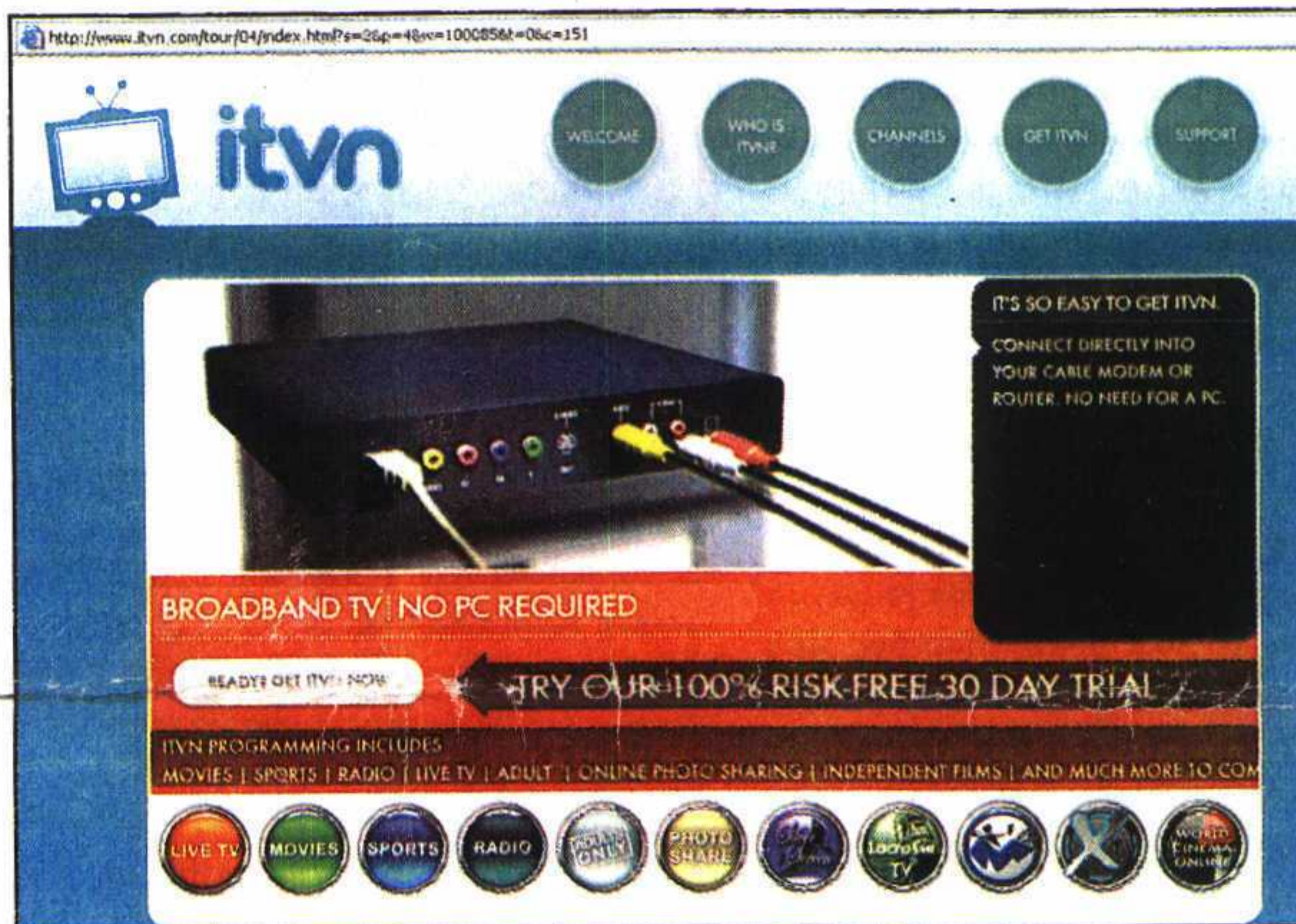
ITVN's small "set-top box" is closer to the size of the Ethernet routers used by others who ride on bandwidth, such as VoIP lines. Outputs are for composite, S-video and RGB video.

Then there's ITVN , Interactive Television Networks. Buy the set-top