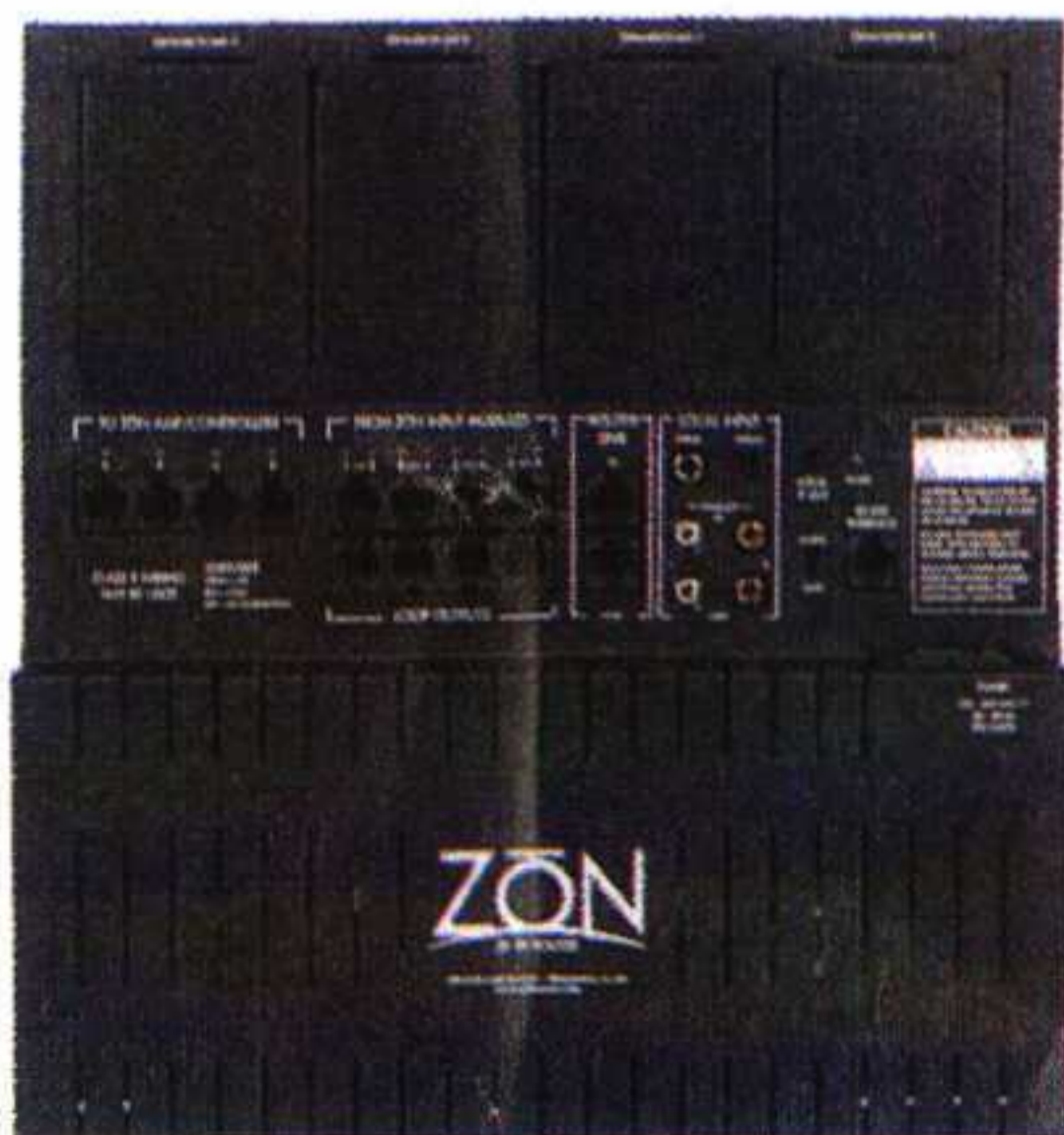
Stylish ZON controllers are supplied through this router.

Adding QoS to bandwidth, several companies offered solutions. One of