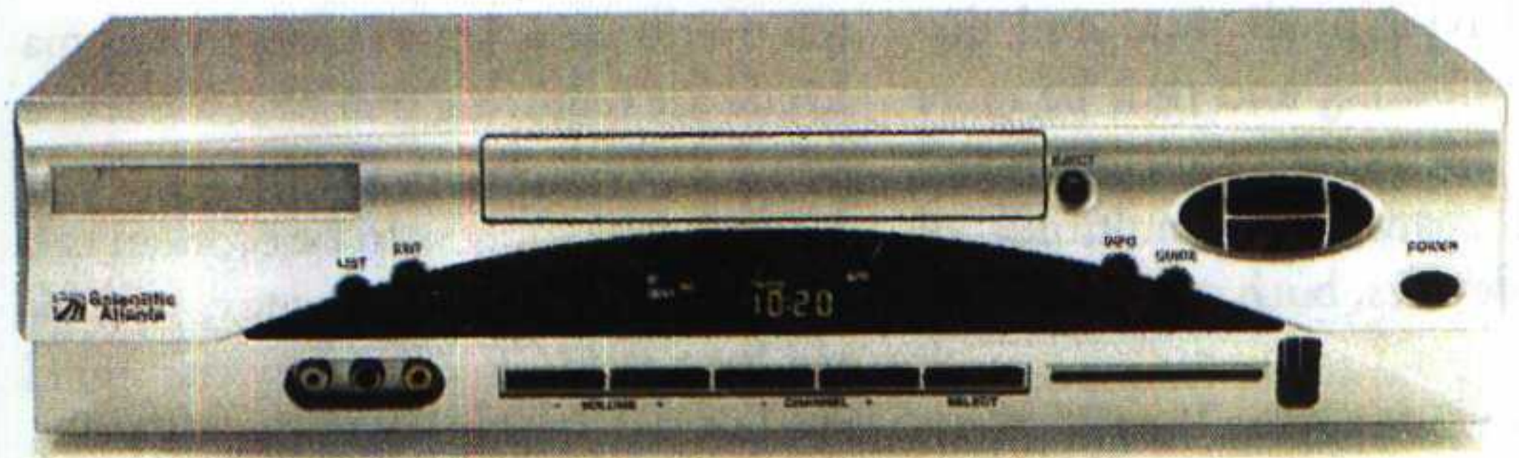
New set-top box from Scientific Atlanta writes to most DVD formats and handles HD content.

Google Co-Founder and President of Products Larry Page demonstrated prototype applications of the popular Google Earth software, including an in-dash version through a partnership with Volkswagen and a real-time